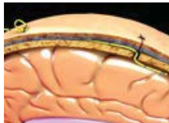
Basic Kit (Subdural)