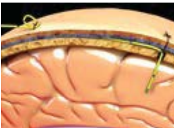
Basic Kit (Parenchymal)

The CODMAN MICROSENSOR® ICP Transducer consists of a miniature strain gauge pressure sensor mounted in a titanium case at the tip of a 100 cm 3F flexible nylon tube. The CODMAN MICROSENSOR ICP Transducer monitors intracranial pressure directly at the source – parenchymal, subdural, or intraventricular.